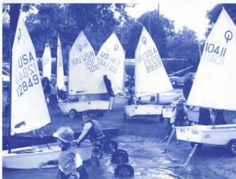
Future Lightning sailors invade PYC

Other PYC events of note included a spring Open House, a Back of the Fleet Help day, and a visit from Skip Dieball of North Sails to provide some pre-race tuning advice and post-race critiquing.