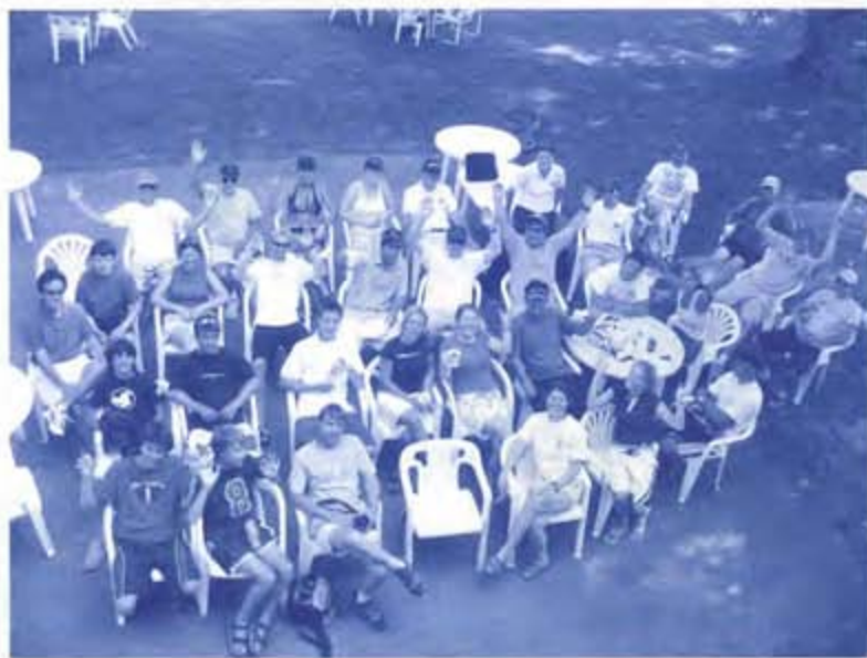
Photo of the participants

A great summer it was for all in Montreal and abroad!!!!