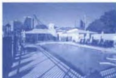
MYC bathhouse and pool