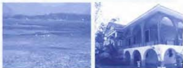
We arrived late (midnight) the day before the start of the

Housing and most meals for the Competitors as well as for both Sally and I and the Judges were provided by the Clube de Campo Sao Paulo. The Club is situated within a Nature Reserve with the housing area about 2 kilometers from the Sailing Center. Transportation between the housing area and the Sailing Center was by tractor and buggy but on many mornings we opted to walk through the reserve, past the golf course, equestrian area and tennis courts. The front deck of Sailing Center provided a great place to have breakfast and watch the abundant wildlife, even if we mistook the Spoonbilled Roseates for Pink Flamingos.