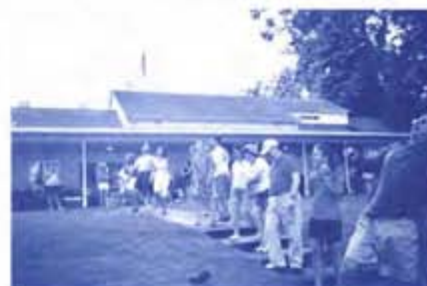
Must be a Midwest thing... shoe flipping at July 4th picnic