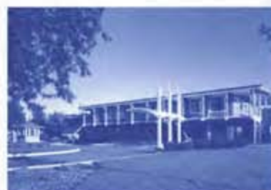
The renovated MYC clubhouse.