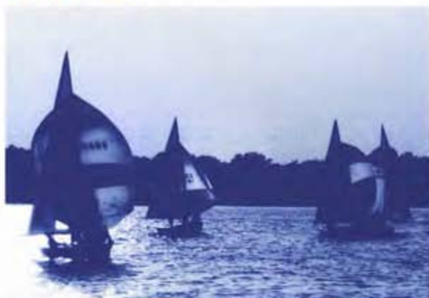
(A) The fleet sails downwind during a Thursday night race

(B) The "Unidentified Flying Pigs" crew sails by on starboard as racing gets set to begin on Sunday at the Pontiac Regatta - Photo by Susanna Telschow