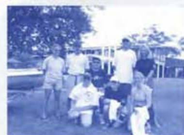
The P&T winners!