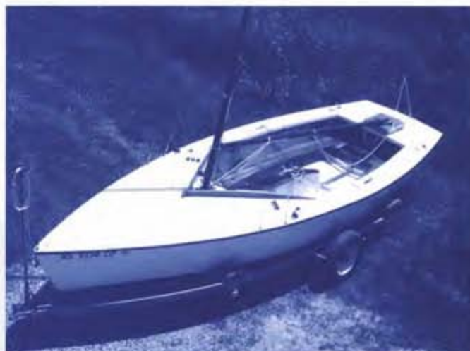
Tomato Sloop 10222