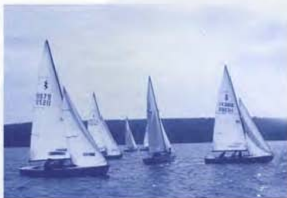
"That's not a regulation Code Flag P!"

Next September autographed copies of Margo's guacamole recipe will be provided to the top 23 boats at the Ed Hinds Memorial Regatta! Be there!