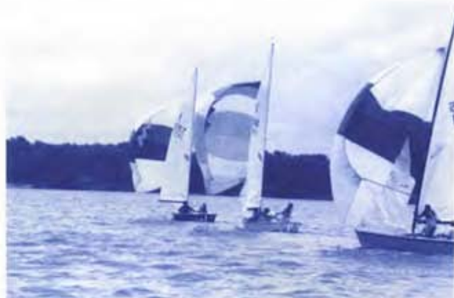
Two photos of the 2004 Hernando Desoto Regatta