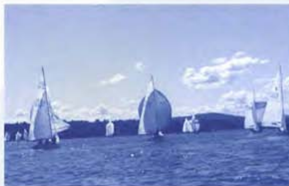
The fleet at Caz Flash Bash 2004