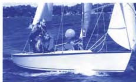
Three generations of Swiharts at the 2004 Hoosier Regatta