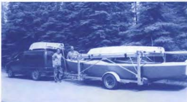
The Bailey regatta caravan all set to go: Lightning, Byte and Optimist.