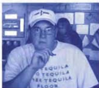
"Is this the way a skipper should treat his crew?"