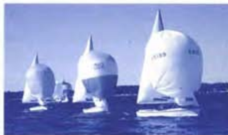
Perfect conditions on beautiful Lake Wawasee

Finally, we invite everyone to join us for the Indiana District regattas in 2005, starting with the Indy Open on April 30 and May 1 in Indianapolis, and the 2005 Hoosier Regatta, scheduled for October 1 & 2. For more information about fleet 154 and the Wawasee Yacht Club, visit www.wawaseeyc.com .