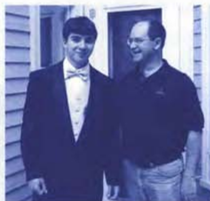
"Skipper and crew don't always have the same dress code!"