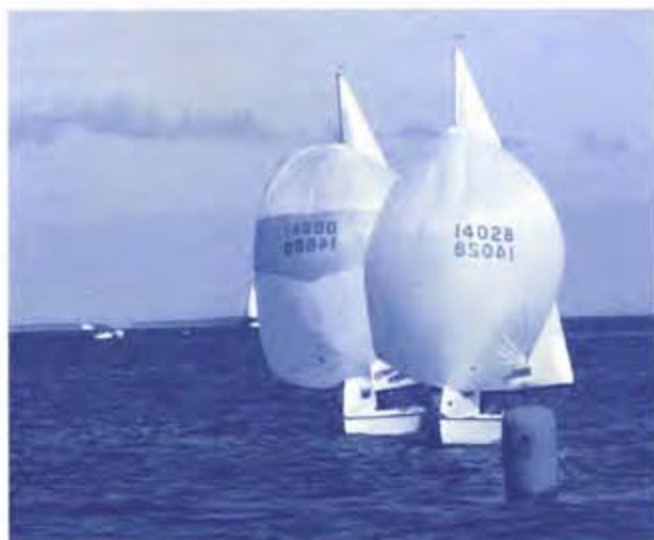
Pre-mark rounding action at our 8th annual invite

Our fleet goals next year are to step up the participation at the out of town regattas.