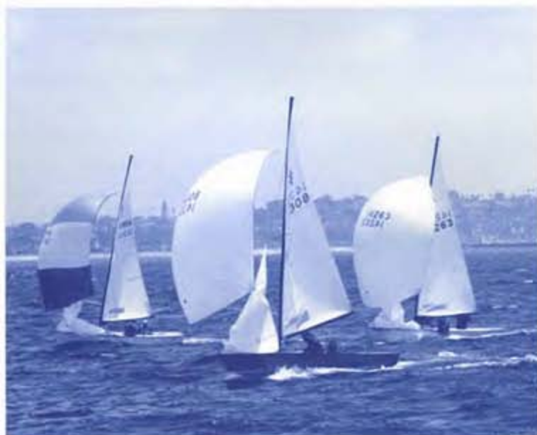
Planing in the Pacific with a rare storm-driven south wind